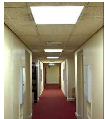
Shown here in-situ

At just 12mm deep the Astrid ModuLite offers the versatility of installation even in shallow ceiling voids. For solid ceiling applications surface mount housings are available. Each luminaire is supplied with a dedicated driver with options of fixed output or dimmable systems.