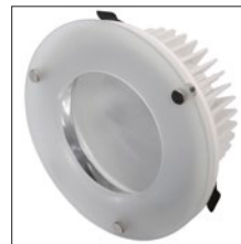
Frosted Halo Drop Glass