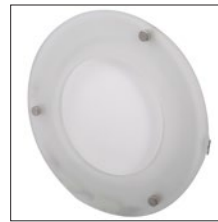
Clear Glass Drop Glass